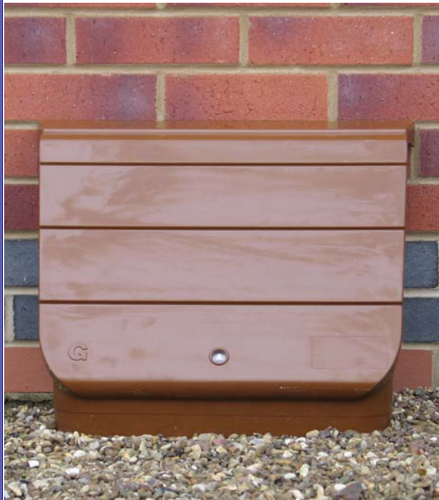
Unibox.....leader in its class, clean lines with rugged construction and composition materials.

Manufactured by Fiorentini UK Ltd, a proven product manufacturer, supplier and station builder to Transco and the PGTs for many years. Outside their own supply Fiorentini utilize only proven and reliable materials known and trusted within the "Gas Industry"